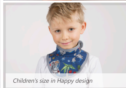
Children's size in Happy design